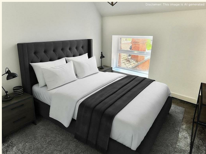
Bedroom 1 (virtually staged) 3.07 x 2.58

The beautifully appointed kitchen has been finished to a high standard and features quality fitted base units, elegant Quartz work surfaces, a one-and-a-half bowl sink with drainer, built-in double oven and hob, integrated under-counter fridge and freezer, integrated washing machine and dishwasher, and an extractor fan. High-quality vinyl flooring, two electric radiators, and contemporary spotlights complete this exceptional living space.