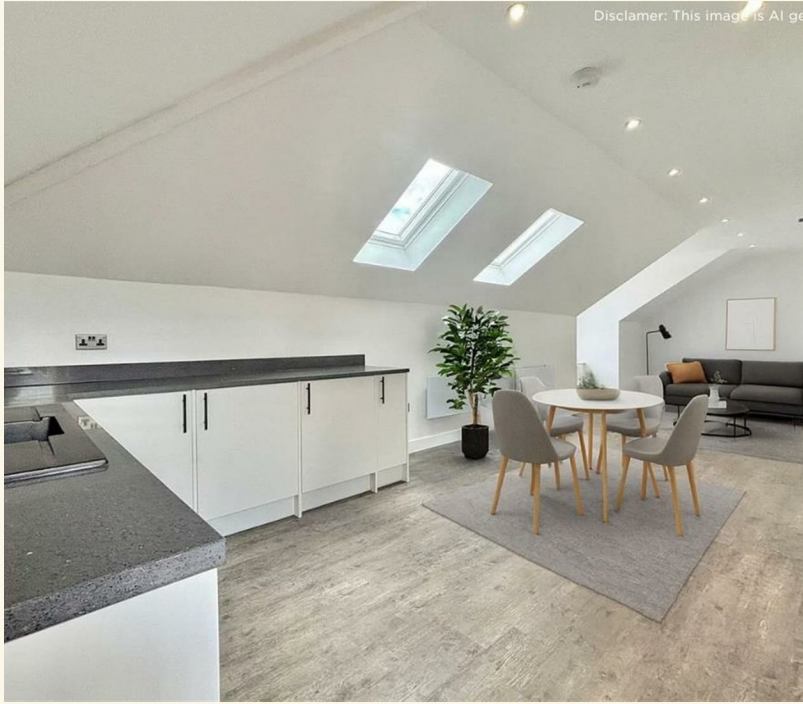
Open Plan Living/Kitchen (virtually staged)

A charming dormer window to the front of the property provides delightful sea views and a cosy window seat, creating the perfect spot to relax and take in the coastal outlook. Two Velux windows to the front and an additional rear window flood this stunning open-plan space with natural light, enhancing the bright and airy atmosphere throughout.